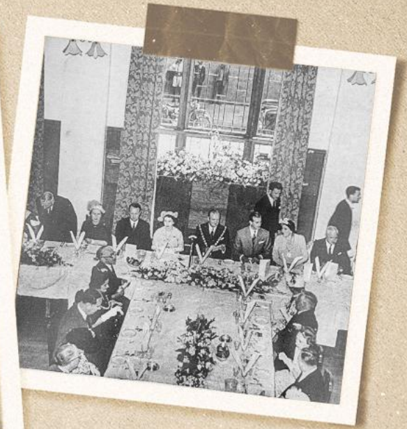
Queen Elizabeth II was 25 years old when her reign began on February 6, 1952.